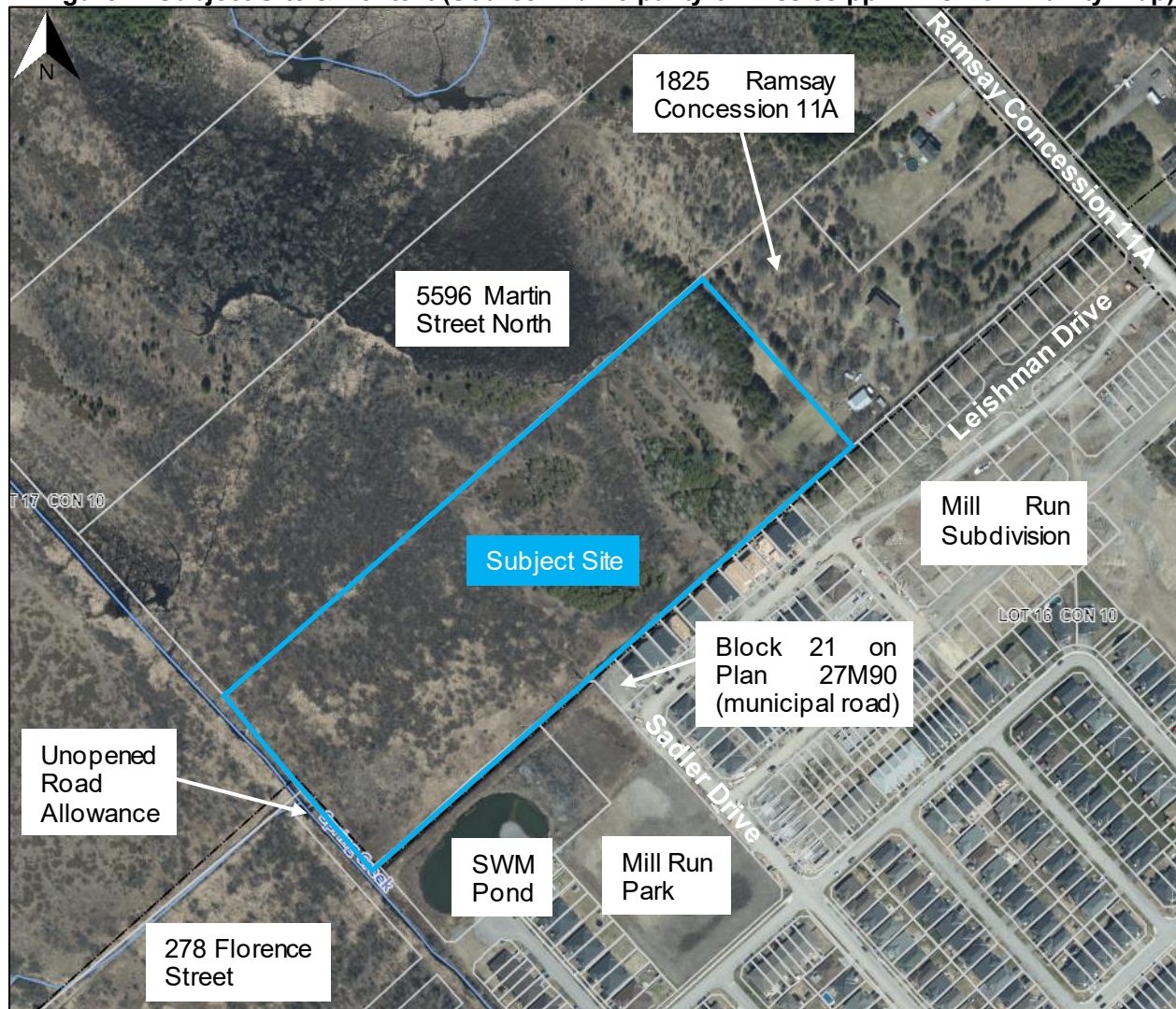
Figure 1: Subject Site &amp; Context